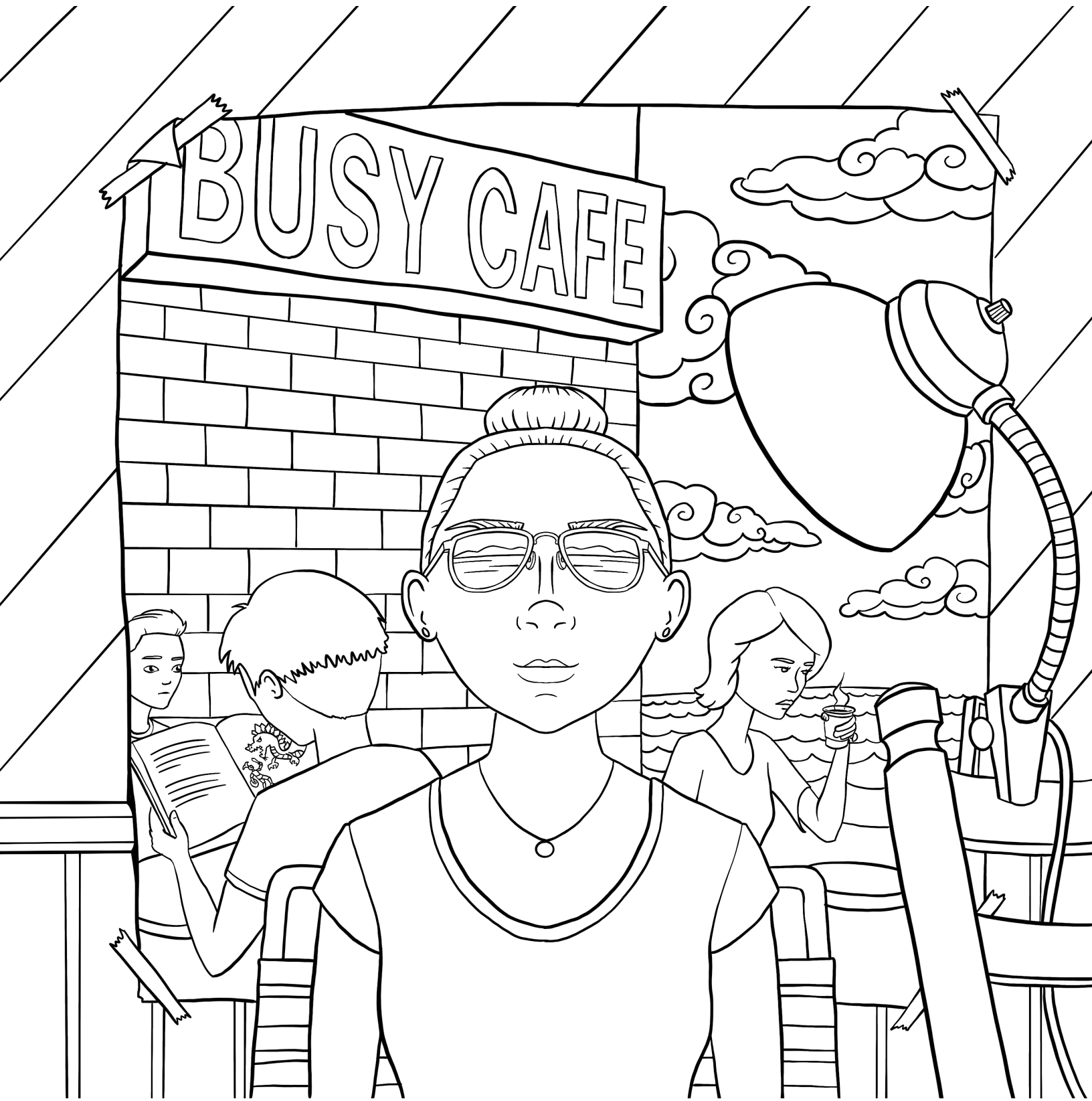
Missing your peeps? Miss the sun on your face? Just a few little props help you manage with grace.